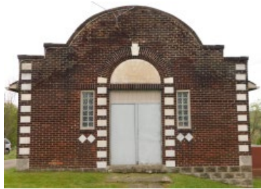
Figure 4: Façade of the chapel at the Elrod Cemetery, Versailles. (Photo, April 28, 2021)

On the afternoon of Tuesday, November 15, 1932, a fire began in the walls of the synagogue. Quick action on the part of the members protected the sacred articles from loss, and although the fire was contained within the walls, the synagogue sustained $2,000 in damage, 25 roughly equivalent to $41,000 at this writing.