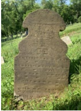
Figure 8: The Jennie Zvibel stone, still wet from cleaning

related to the effects of lichens on stone is not entirely settled 249 , their detrimental effects, both mechanical and chemical, have been widely documented 250 .