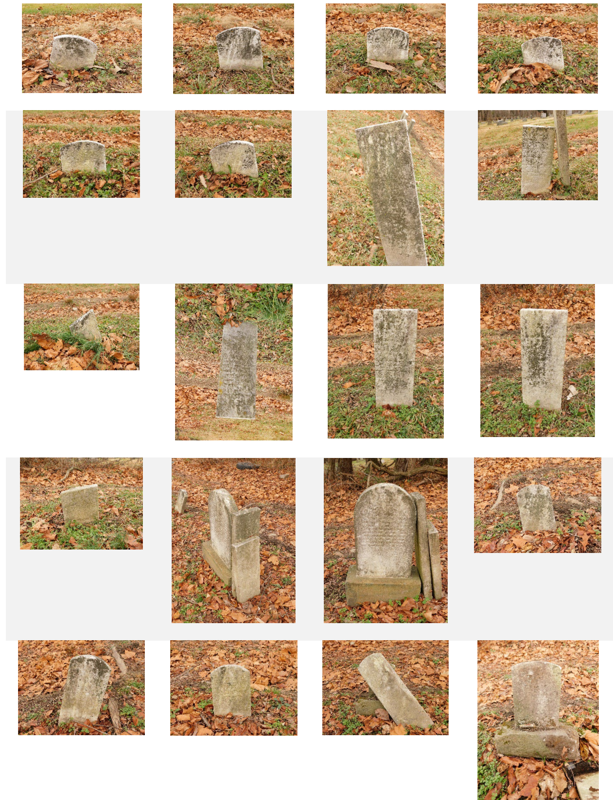
Figure 1: Gravestones at the Keshet Israel Cemetery, Port Vue. Row 1, in south-north order (L to R, Top to Bottom).