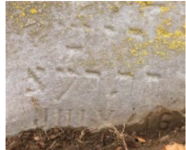
Figure 6: "July 16" in English and "-uz 5671" in Hebrew together yield "July 16, 1911"

The answer came from within the cemetery itself. Specifically, it came from the last partially-visible line of the inscription on one of the stones. Indeed, it was one of only two partially-visible lines on any of the stones in the cemetery.