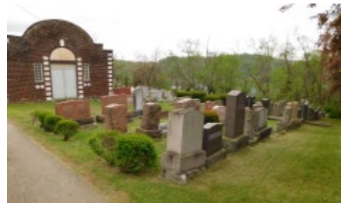
Figure 3: The second Kesher Israel cemetery, at Elrod, purchased 1917

On August 24, 1917, the "Kasher Israel Ancha Sward Congregation of McKeesport" purchased two adjoining parcels of land totaling 28,500 sq. ft. (0.65 acres) at the rear of the Temple B'nai Israel property at Elrod. 18 Approximately one half of this, "3377/10000 acre" was purchased from Temple B'nai Israel. 19 This three-tenths of an acre lay directly in front of the chapel building, with a 65' side lying along the alley that separates the Temple B'nai Israel Cemetery from that of Gemilas Chesed (a.k.a. the Austro-Hungarian Hebrew Cemetery).