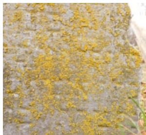
Figure 7: The “July 16, 1911” stone, the face obscured by lichen growth.

With such scant information available from the stones, the one with the “July 16, 1911” date became the focus of our efforts for a while. Was it, in fact, the gravestone of Jennie Zvibel?