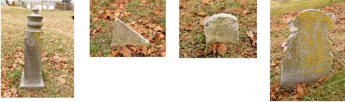
Figure 2: Gravestones at the Keshet Israel Cemetery, Port Vue. Row 2, in south-north order (L to R).