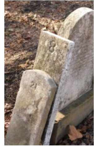
Figure 5: Examples of “slab” and “arch top” stones. Photographed as found, Feb. 28, 2022.

There are ten “arch-top” stones at Keshet Israel, nearly all of which are no longer legible despite the depth of the original numeric inscription. Under oblique lighting, stones can be seen to be clearly etched with the numbers 2, 4, 6, 7, 9, 18, 20, 21, 22, and 24. There are other numbered “arch-top” stones which, to date, defy identification. One bears the digit 9, offset to the right of the centerline as if to suggest another digit to the left, but none is apparent. Given the sequence of identified numbers, 19 seems a reasonable assumption.