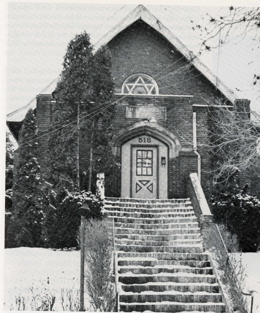
This photograph of the facade of Ohev Scholom Synagogue was taken in 1983. Some changes had been made.

A committee comprised of the remaining leaders: