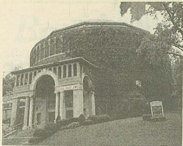
JUNE will mark the end of B'nai Israel as a home to its congregation. Final services will be held there June 29-30.