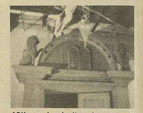
ARK contains the lions from Beth El and cabinet and Ner Tomid from Ohave Israel, the Brownsville synagogue.

Attention synagogue leaders: These pages, produced monthly by the Synagogue-Federation Relations Committee, are devoted to news of area synagogues. Your comments, ideas, or items of interest are welcome. Please address them to the Synagogue. Federation Relations Committee, 234 McKee Place, 15213.