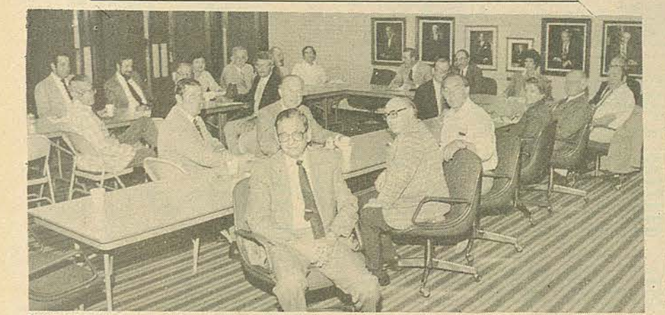
iYNAGOGUE-Federation Task Force at its June meeting prepares the groundwork of the coming year.

Remember that a synagogue is a house of learning as well as of prayer. Visit a synagogue library and see