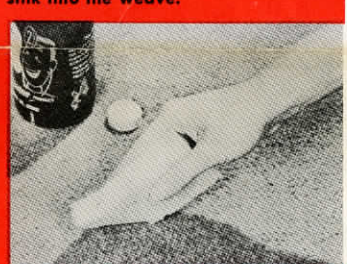
Then wet a sponge with the proper cleaning solution, and feather it lightly over the spot. Blot with a tissue