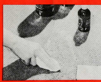
Then blot spot again and again with a face tissue, folding and turning the tissue as it becomes damp.