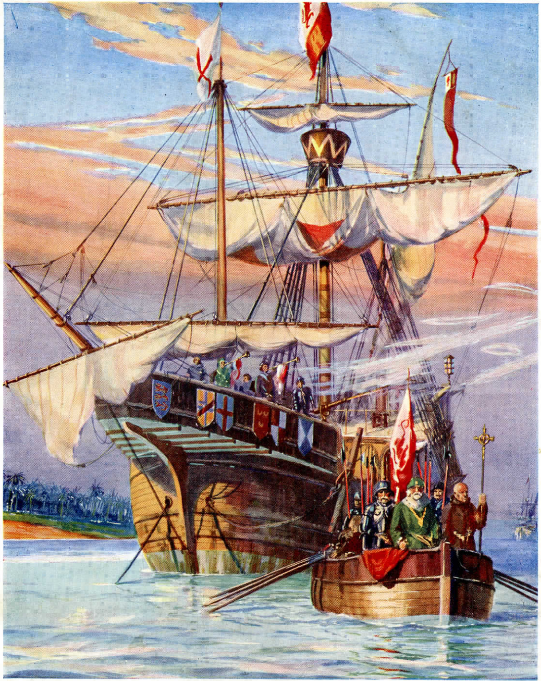
"Santa Maria," The Flagship of Christopher Columbus, 1492. Length of ship, proper, 93 feet. Beam 25-71 feet. Displacement 233 tons.