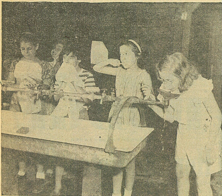
Early morning wash-up time for campers at beautiful Laurel Y Camp in anticipation of an active and exciting day. This scene will be repeated many times during the coming camp season.